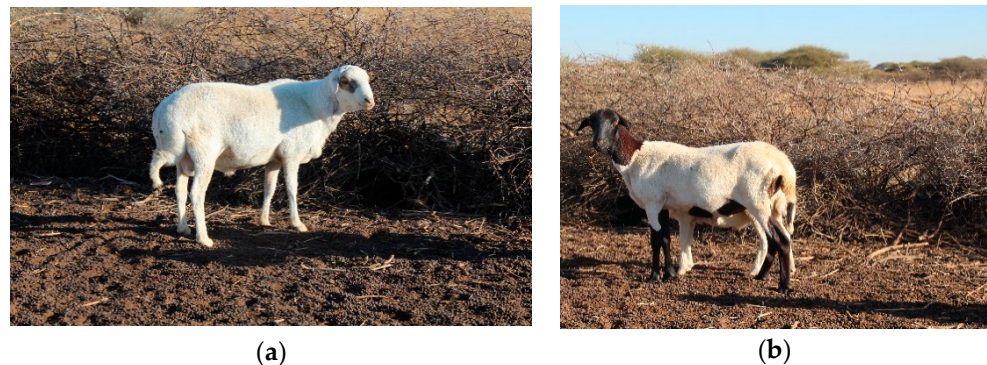
Figure 1. (a) Indigenous Tswana ram, (b) Indigenous Tswana ewe: Pictures of indigenous Tswana sheep.

In Botswana, there are about 300,000 sheep of various breeds of which 65% are indigenous Tswana sheep [7]. The indigenous Tswana sheep (Figure 1) dominate the national flock population. They are mainly bred for meat production, and it is uncommon for them to be milked. Indigenous Tswana sheep are highly adapted to prevalent harsh environmental conditions and resilience to endemic diseases. They can walk long distances and survive well on low-quality forages [1]. Under such environmental conditions, the performance of Tswana sheep with regards to survival and production is better than its exotic counterparts such as Dorper [8]. Despite all these, the existence of Tswana sheep is under threat of immensely being replaced by the less adapted exotic breeds and crossbreds [7] that are of high maintenance costs to resource-poor rural farmers. This is because farmers practice uncontrolled crossbreeding that is performed without evaluating and setting optimum breeding goals [9].