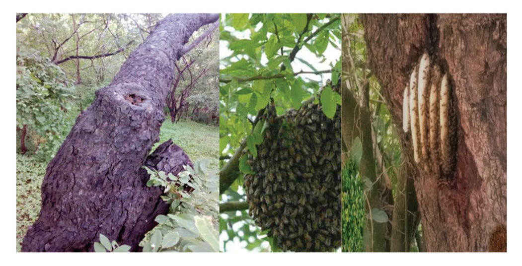
Figure 3. Observed honeybee nesting sites Nyamakate communal area (Agness Gapa).

A.m. scutellata makes use of a variety of nest sites across all sampled villages. All sites that were not on the ground were more than 2 m above ground (Figure 3), and only 19 nest sites for A.m. scutellata and 5 nest sites for M. rotundata were on the ground/ anthills. Nest site selection is critical: poor choice can increase predation and nest destruction and result in reproductive failure.<sup>[6]</sup> Apis dorsata and A. florea can nest in open combs, whereas Apis cerana mainly nests in cavities at an average height of 1.5 m.<sup>[6]</sup>