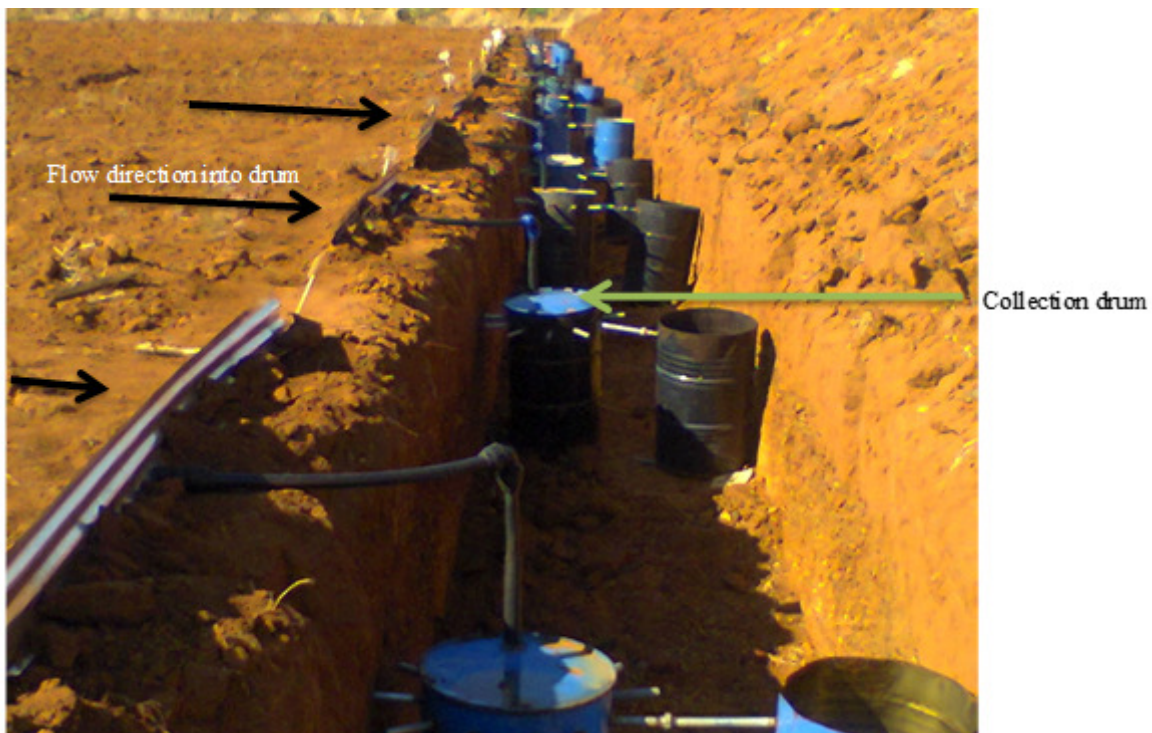
Plate 1: Runoff collection system